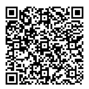
Christ Church Privacy notice