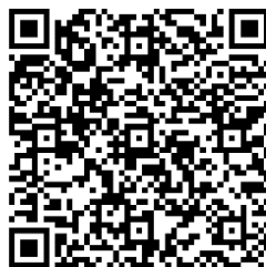
Christ Church Privacy notice